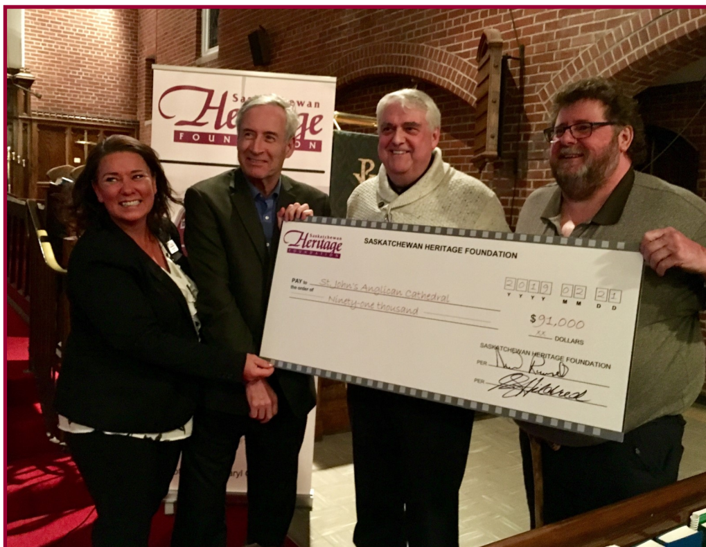
Cheque presentation to St. John's Anglican Cathedral—Saskatoon