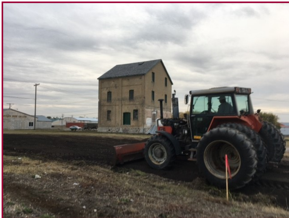
Yorkton Brick Flour Mill Restoration Project