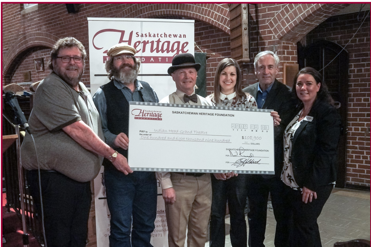
Cheque presentation to Indian Head Theatre & Community Arts Inc.