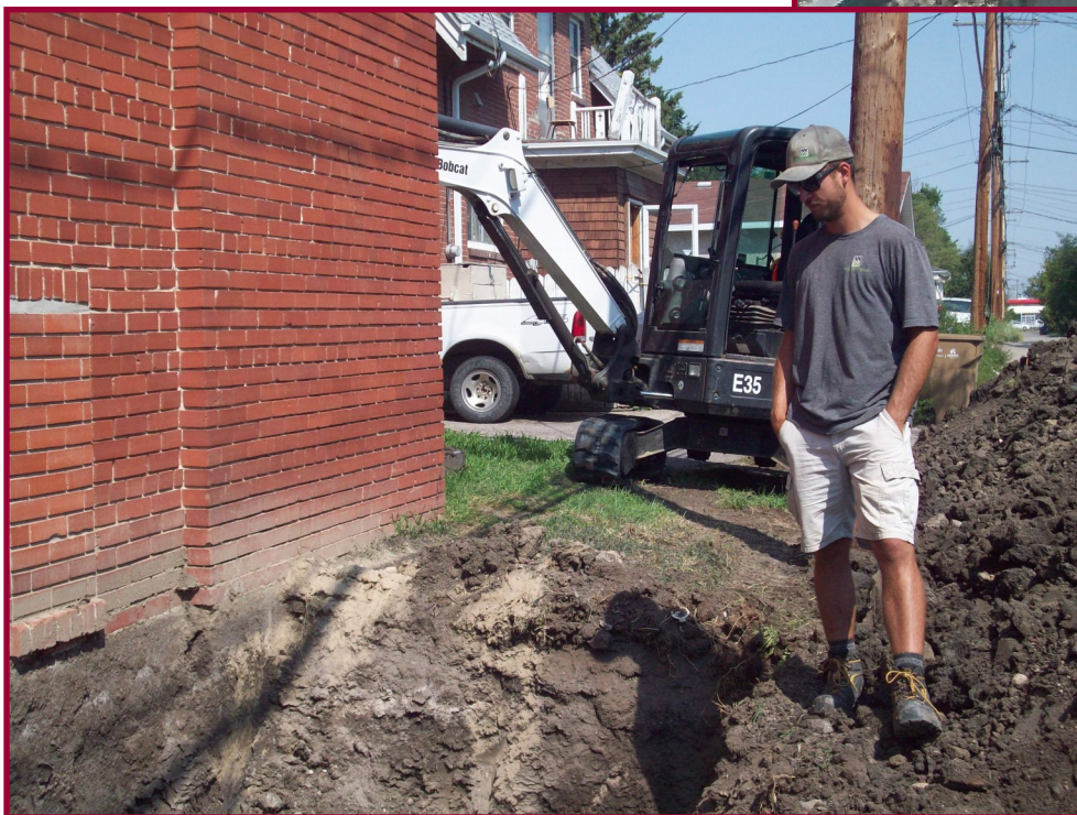
Forensic foundation investigation and preliminary geotechnical investigation at St. Matthew Anglican Church—Regina