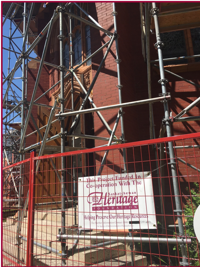
Work in progress at St. John's Anglican Cathedral in Saskatoon.