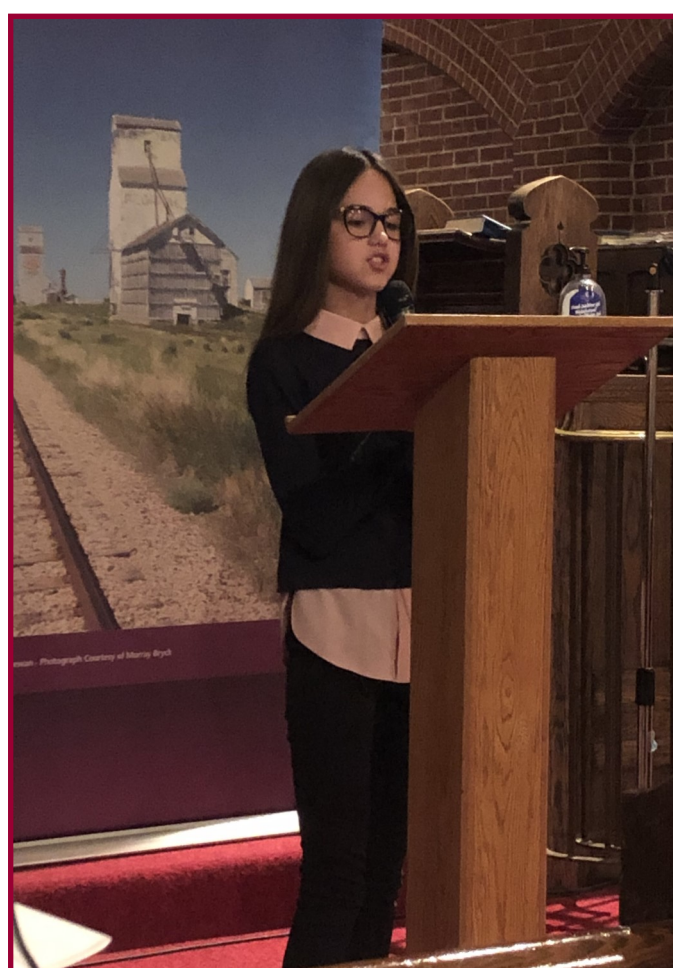
Heritage Fairs award winners from Moose Jaw and White City