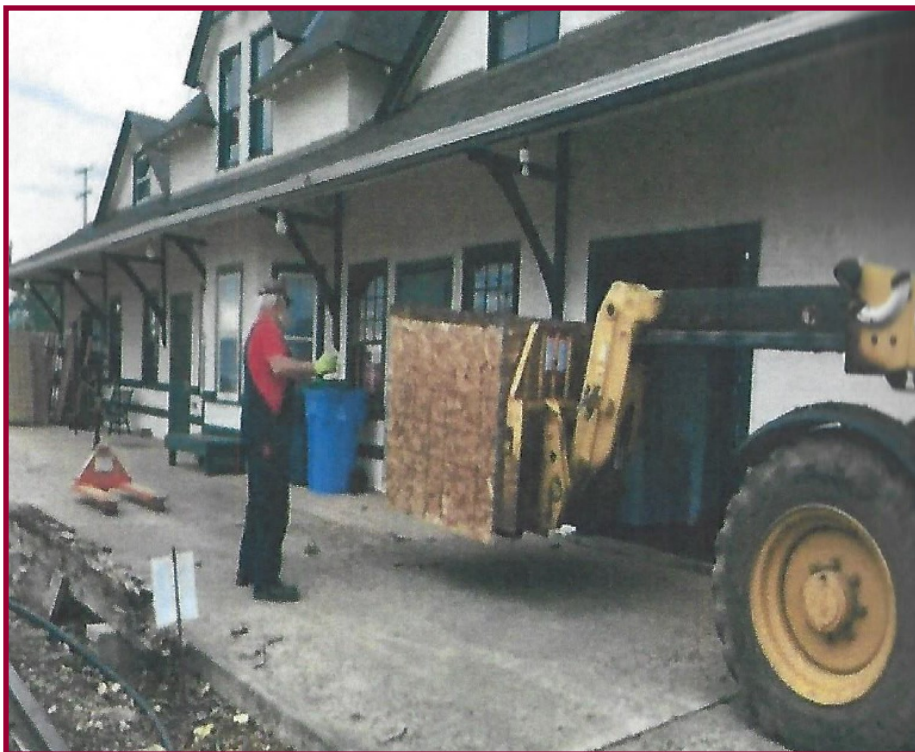
Left—Window restoration at the Radville CN Station.