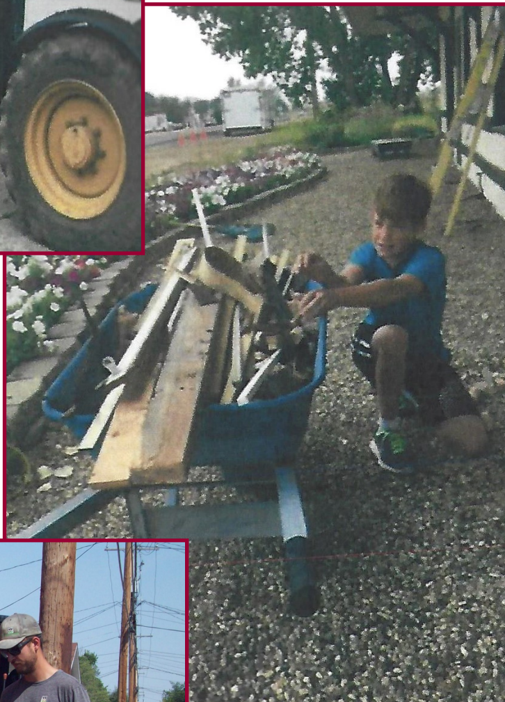
Below—Clean up of the site after completion of the project.