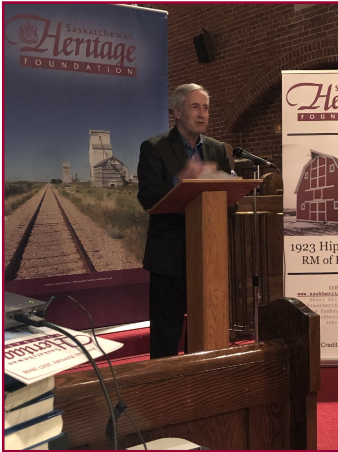
Honourable Mark Docherty brings greetings on behalf of the Government of Saskatchewan.