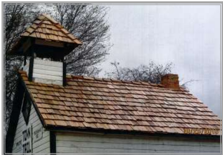
Prud’homme Town Jail Prud’homme