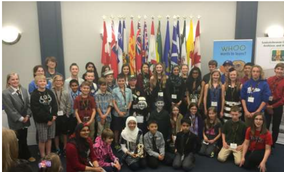
Participants in the 2016 Provincial Heritage Fair Showcase in Regina