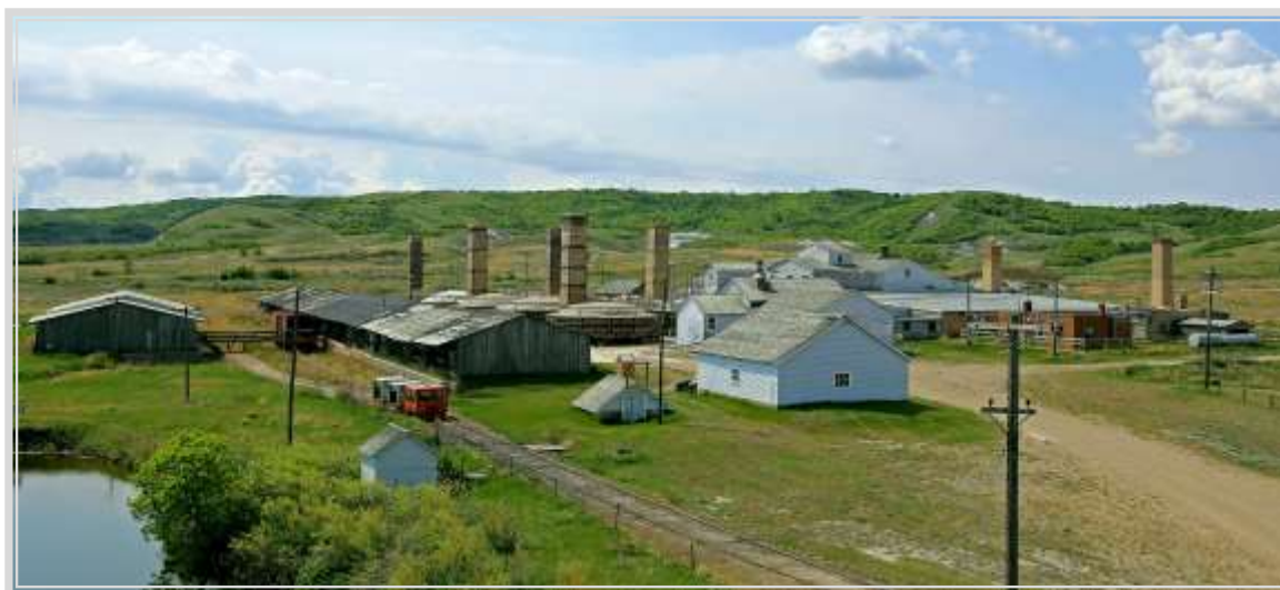
Claybank Brick Plant National Historic Site and Provincial Heritage Property

In 2016, the Foundation received a report from the Prince’s Charities Canada detailing the results of its research to develop a feasibility and long-term sustainability plan for the site. Prince’s Charities Canada has significant relationships with Prince’s Charities in the United Kingdom, including The Prince’s Regeneration Trust.