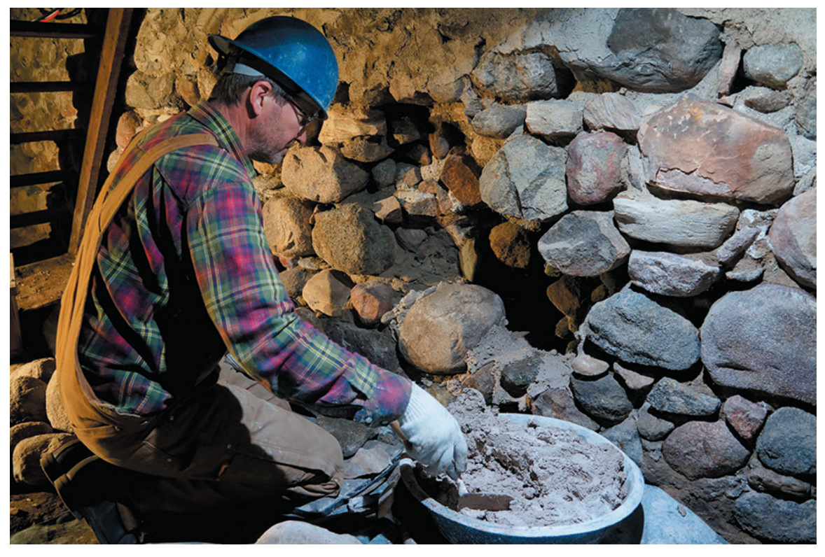
Grand Theatre - Indian Head