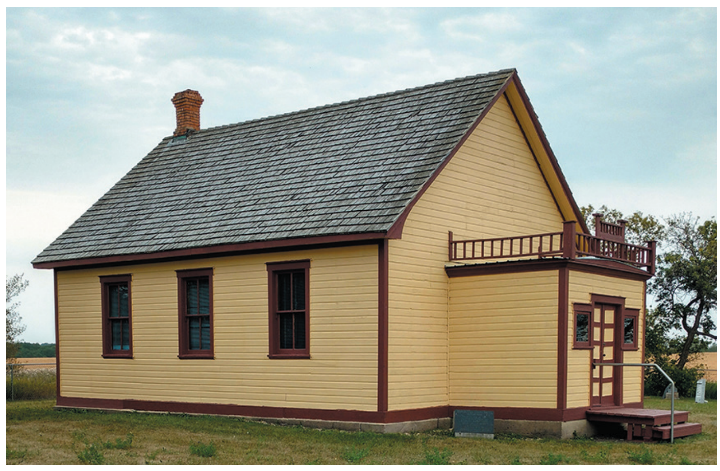
Evangelical Mission Church - RM of Fertile Belt #183

SASKATCHEWAN HERITAGE FOUNDATION ANNUAL REPORT 2017-2018