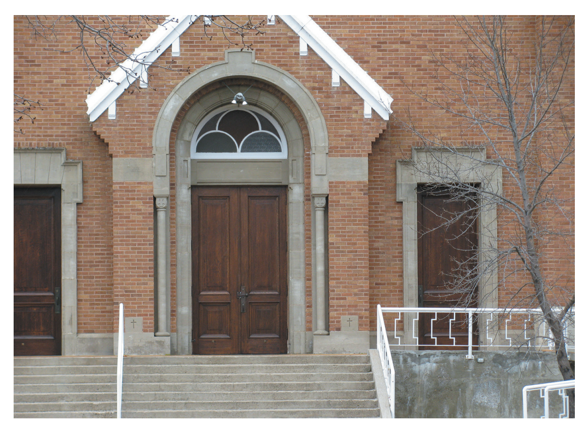
Notre Dame d'Auvergne Catholic Church - Ponteix